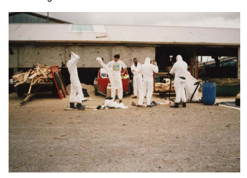
Contaminated site cleanup

A 1992 Ministry for the Environment study concluded that about 400 potentially contaminated sites exist within the Northland Region. These range from landfill sites to closed gasworks sites and oil terminals.