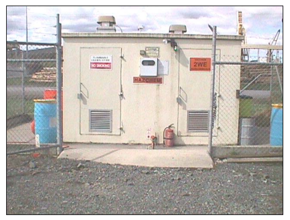
Hazardous wastes store

Recognising the risks that many of these substances may have on the environment the Northland Regional Council has since 1993 continued to provide an ongoing service for the collection, storage and disposal of waste hazardous substances. In conjunction with Wrightson, four agricultural chemical depots are located at Kaitaia, Waipapa, Dargaville and Whangarei. An additional purpose-built store is also located in Whangarei. This store is used for the temporary storage of the higher risk chemicals prior to despatching them to Auckland.