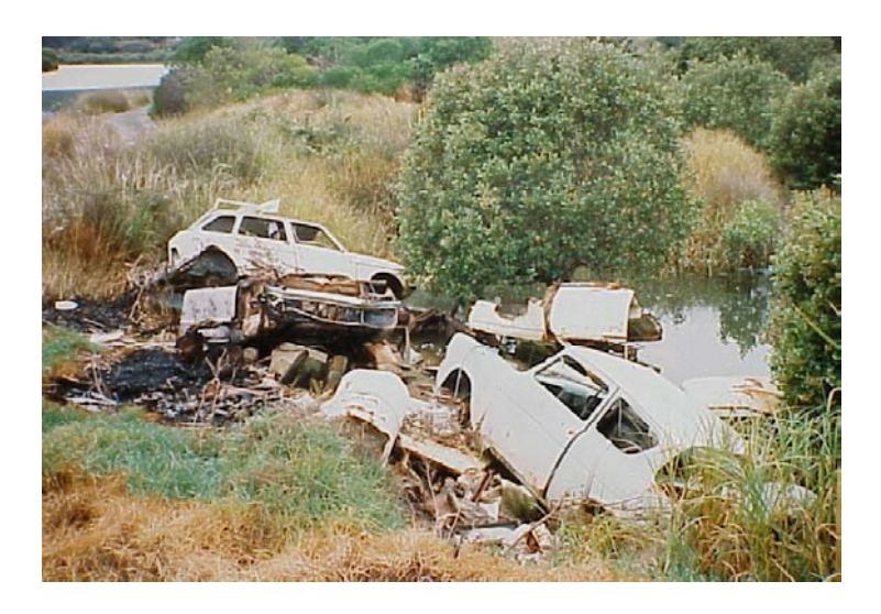
Illegal dumping of car bodies and waste

The incidence of illegal dumping in Northland has declined over recent years, which is most likely attributable to a number of factors. These include more facilities available for waste disposal (transfer stations), and increased public awareness through education and enforcement action.