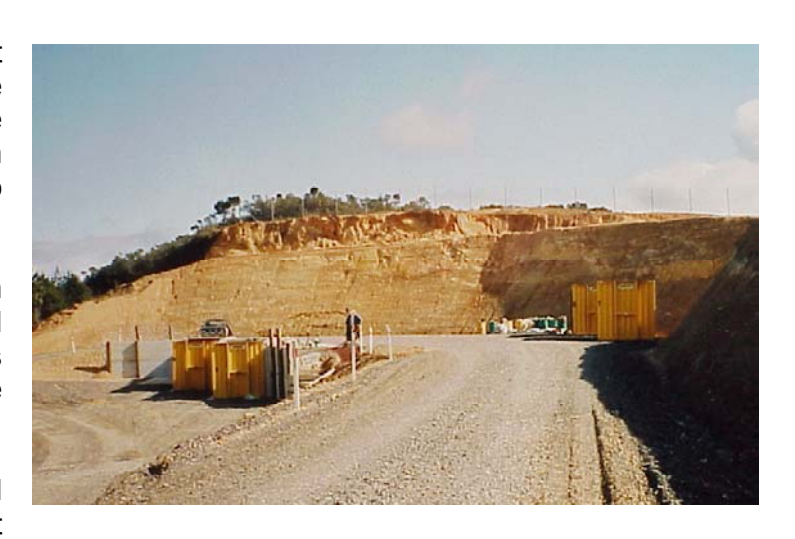
Modern Transfer Station

The Far North and Whangarei District Councils are in the