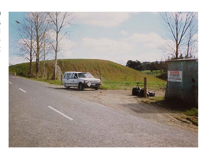
Rehabilitated landfill site at Kaiwaka

All operational landfills are monitored on a sixmonthly basis. Surface water and sediment samples are collected from locations adjacent