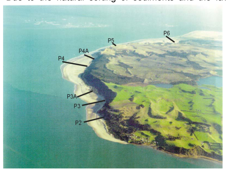
Pouto shoreline showing location of survey P2-P6 Noel Hilliam

Mt Rex holds the sole resource consent for the continued extraction of sand from the Pouto shoreline, which was granted in 1992 and expires in 2004. The resource consent allows for a maximum of 60,000 m³ to be extracted per year. Annual extraction volumes however are generally in the order of 40-50,000 m³ per year. The area in which the resource consent allows extraction to occur is a subtidal, nearshore strip immediately adjacent to the shore and approximately between sections P3-P4. Due to the natural sorting of sediments and the favourable depths at which this