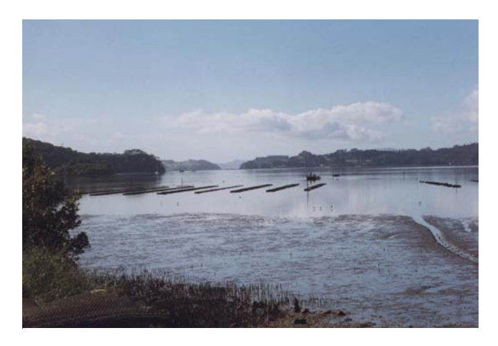
Marine farm at Whangaroa Harbour

Since the introduction of the Resource Management Act in 1991, the Northland Regional Council has granted 34 resource consents for marine farms, primarily for cultivation of the Pacific Oyster. There are however approximately an additional 102 MAF-licensed marine farms that were granted licenses prior to 1991. These vary in condition from those that are currently in use to those that have been abandoned.