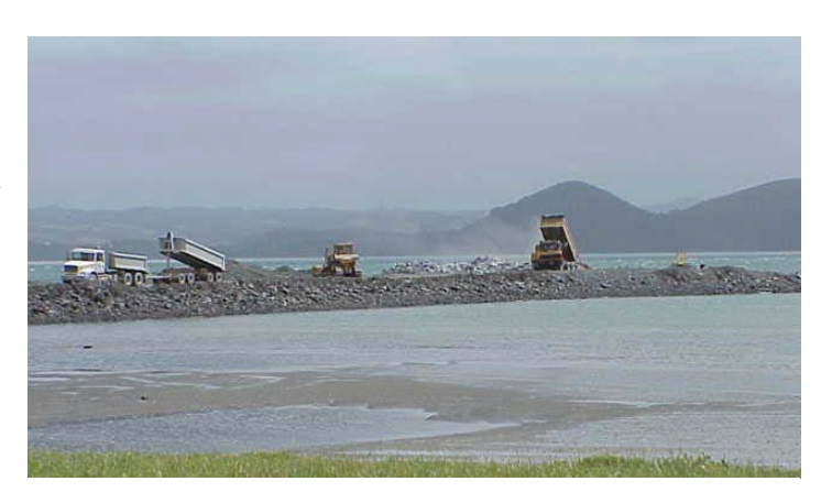
Reclamations underway for the new deepwater port at Marsden Point

The Whangarei Harbour in particular is Northland's main shipping Considerable modification of sections of the inner harbour has occurred. through reclamations and the construction of port facilities. These practices continue, with the new deepwater port facilities under construction inside the entrance to Whangarei Harbour.