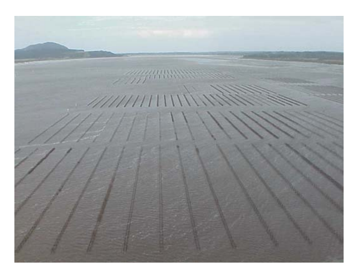
Marine farm at Houhora Harbour