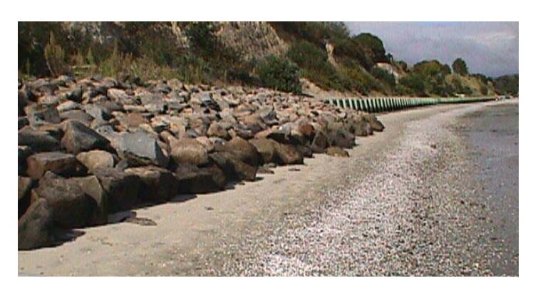
In some areas rock walls have significantly altered the natural character of Northland's coastal environment

By far the greatest concentration of Northland's population and development has occurred along the east coast. The many estuaries and embayments contain large numbers of residential houses. Often with these are associated structures such as jetties, boat ramps, seawalls and rock revetments.