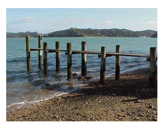
A typical coastal structure in Northland