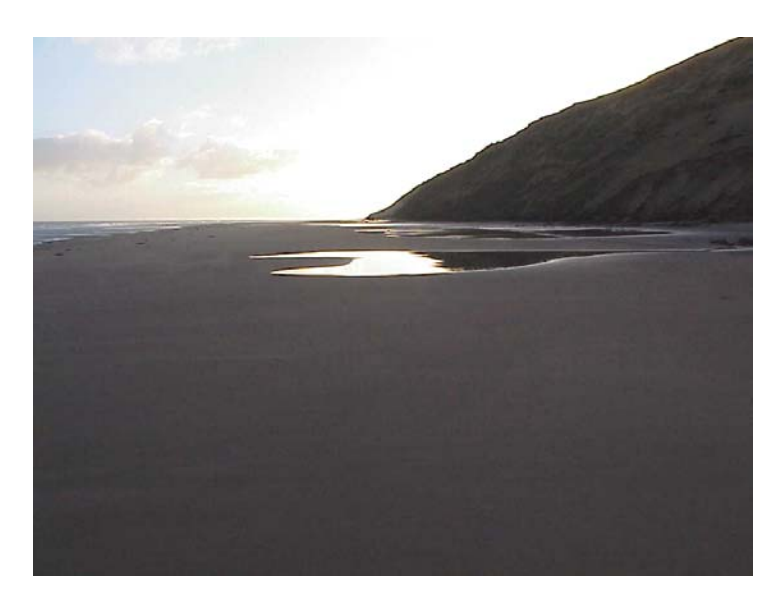
Pouto Peninsula, Kaipara Harbour

Pleistocene cliffs. The North Kaipara Head in particular is a unique coastal landform with vast shifting sand dunes.