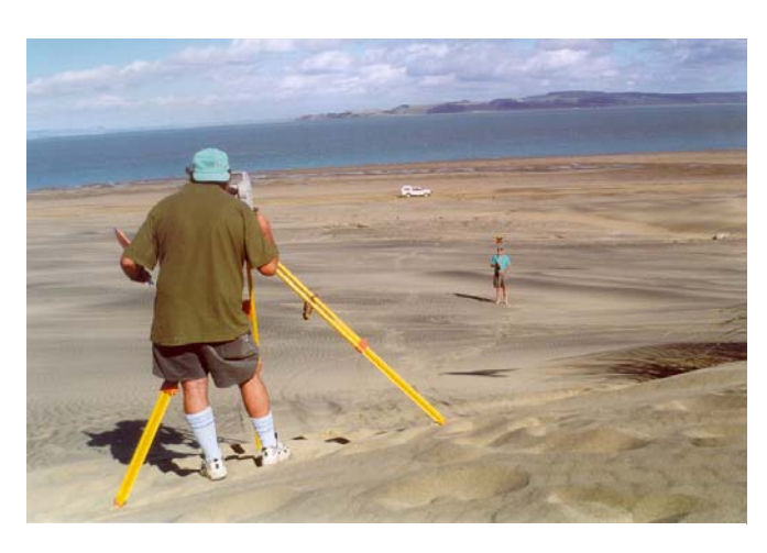
Beach profile survey of Pouto shoreline, Kaipara Harbour

A significant portion of the monitoring of the shoreline and coastal waters is required by various resource consents such as those for the extraction of sand. Other monitoring within the coastal environment is carried out for specific projects, for example the review of coastal hazard information at various locations. Both types of monitoring provide valuable information on the 'state of Northland's environment'.