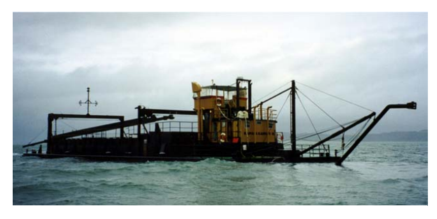
Dredge operating on the Kaipara Harbour

The Minister of Conservation granted resource consents in 1997 to Winstone Aggregates Ltd and Mt Rex Shipping to extract sand from an area inside the entrance to the Kaipara Harbour. A consent condition required that a study into the sustainability of sand extraction and an assessment of the sand reserves of the Kaipara Harbour inlet be undertaken.