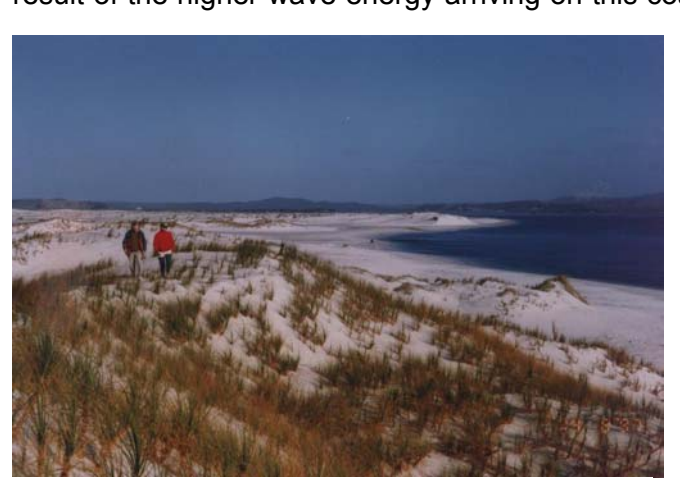
Parengarenga Harbour - South Head

By contrast, the west coast has a relatively smooth outline, broken only by the mouths of several extensive harbours such as the Kaipara and Hokianga harbours and the occasional headland. The wide expansive beaches along its length are the result of the higher wave energy arriving on this coast from the Tasman Sea. Beach