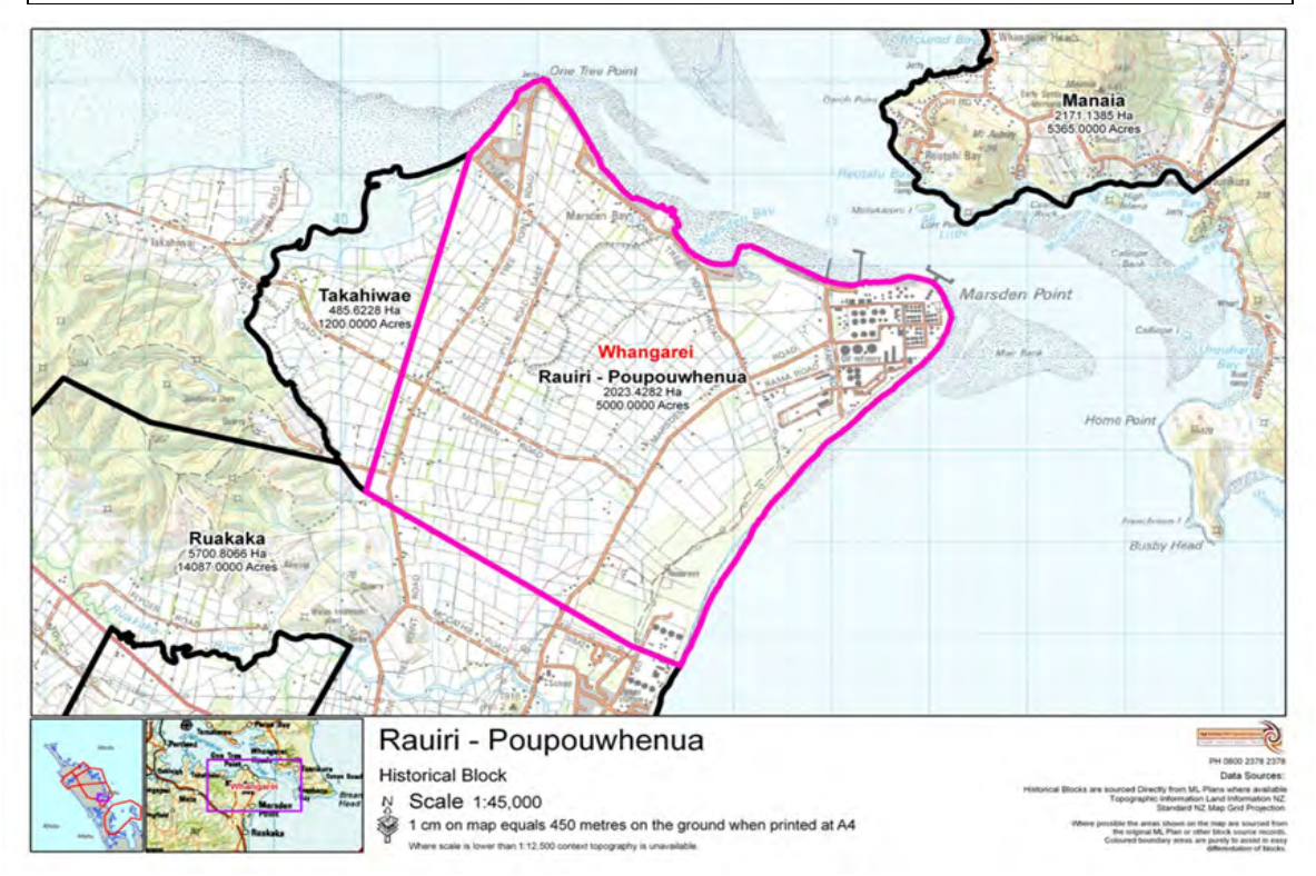
Figure 2: Poupouwhenua Block